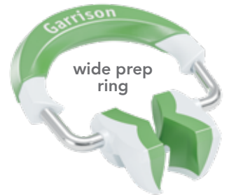
wide prep ring